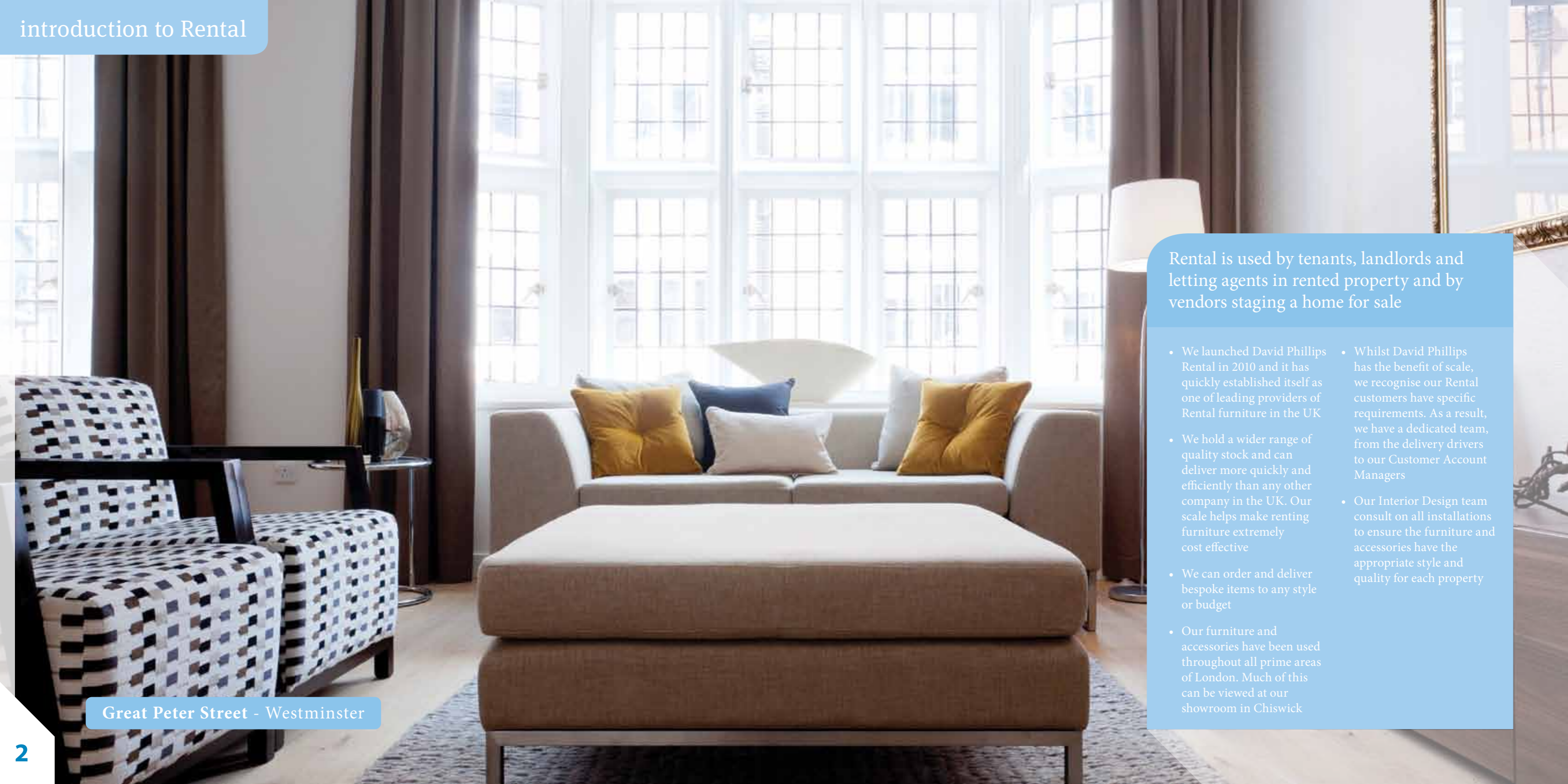
Great Peter Street - Westminster

Rental is used by tenants, landlords and letting agents in rented property and by vendors staging a home for sale